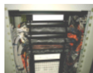
Cabling & Wiring